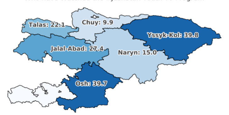
Figure SEQ Figure \* ARABIC 12: Viewership data by region

Percent of the Local Population from Project Locations Who have Watched the #JashStan Youth TV Program