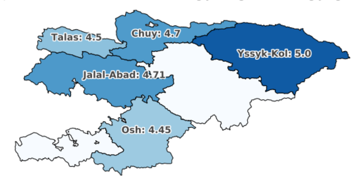
Figure SEQ Figure \* ARABIC 10: Youth capacity for advocacy

Because of the #JashStan project, I feel more capable of advocating youth issues in my community (Mean Score on a Scale of 1-5: Strongly Disagree to Strongly Agree)