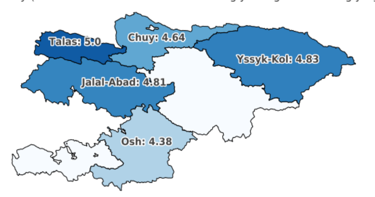
Figure SEQ Figure \* ARABIC 2: Youth sense of belonging

Because of the #JashStan project, I feel a greater sense of belonging in my community (Mean Score on a Scale of 1-5: Strongly Disagree to Strongly Agree)