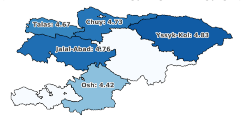
Figure SEQ Figure \* ARABIC 3: Opportunities to advocate for tolerance

Because of the #JashStan project, I have had opportunities to talk to my peers about ways to prevent violence and extremist attitudes (Mean Score on a Scale of 1-5: Strongly Disagree to Strongly Agree)