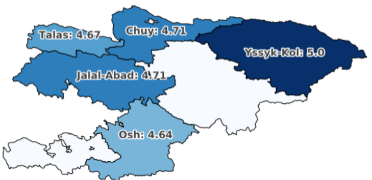
Figure SEQ Figure \* ARABIC 5: Participant rating of mentors

Direct Beneficiary Rating (Mean Score out of 5): Effictiveness of Work with Mentors