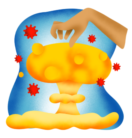
Figure 2. An alternative pandemic narrative that presents coping strategies.

Figure 1. An apocalyptic pandemic narrative.