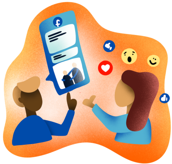
Figure 6. Creating different stories of coping experiences.